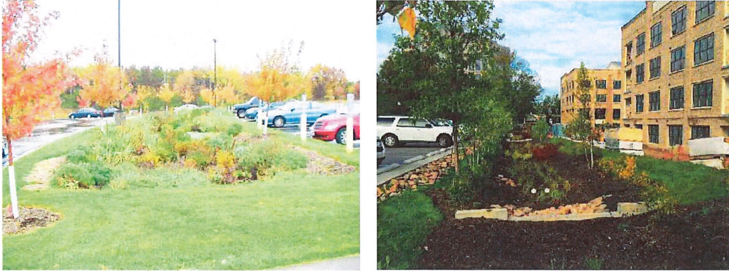
Figure 4.8: Examples of Stormwater Control Measures