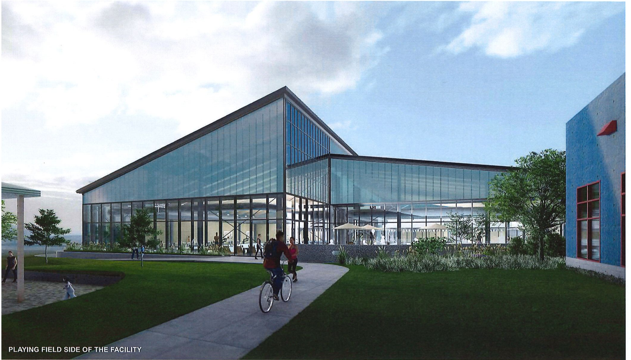
PLAYING FIELD SIDE OF THE FACILITY