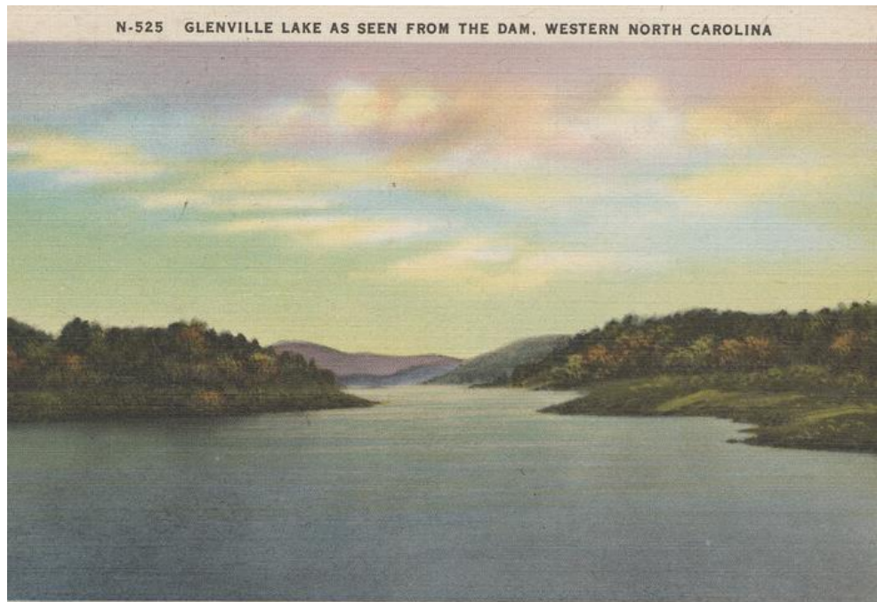
N-525 GLENVILLE LAKE AS SEEN FROM THE DAM, WESTERN NORTH CAROLINA