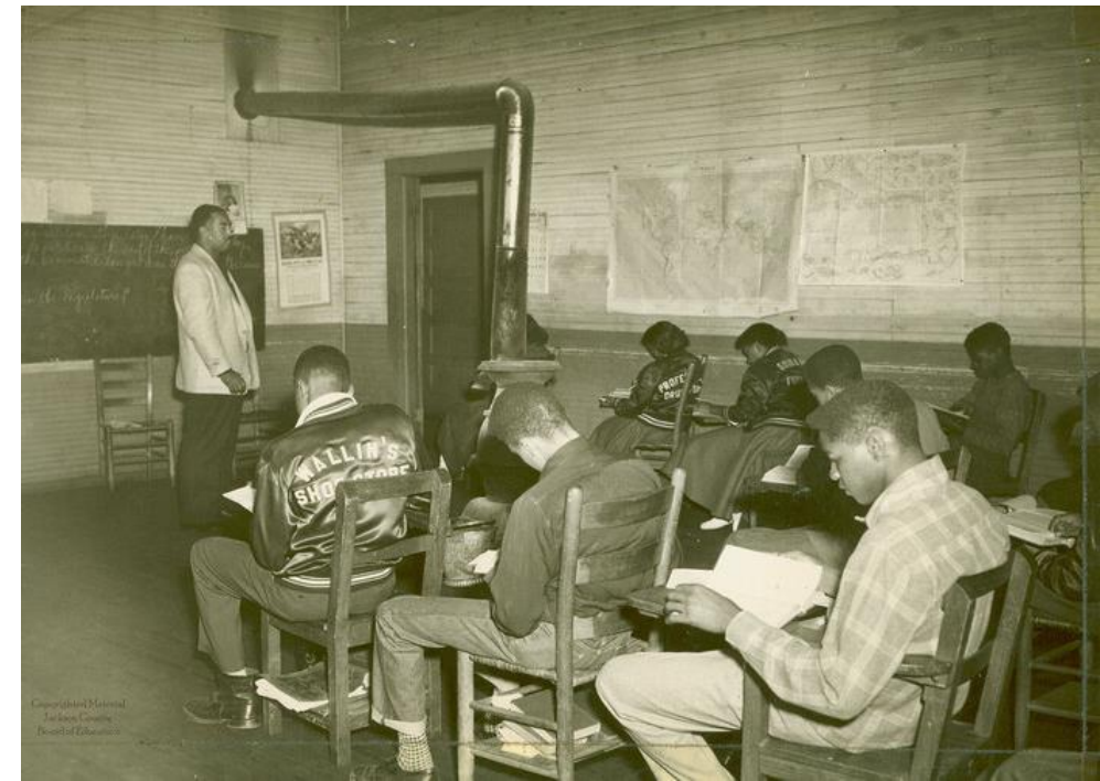
Copyrighted Material Jackson County Board of Education