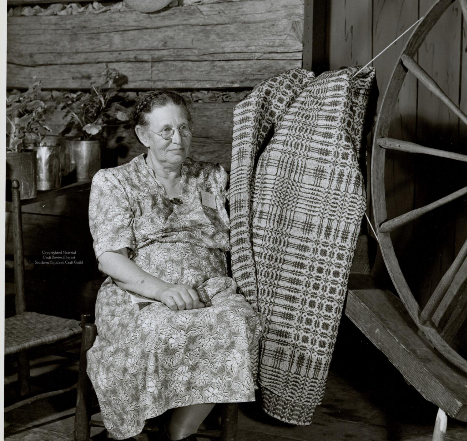
Copyrighted Material Craft Revival Project Southern Highland Craft Guild