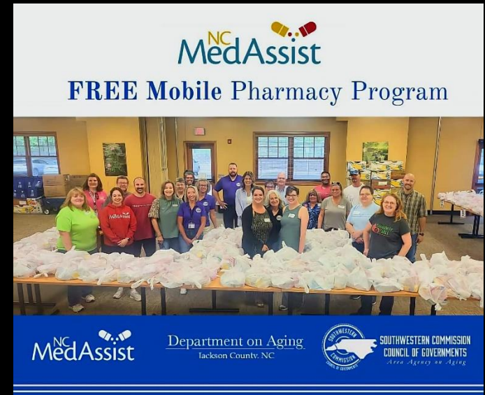
Mobile Free Pharmacy/Shred Truck