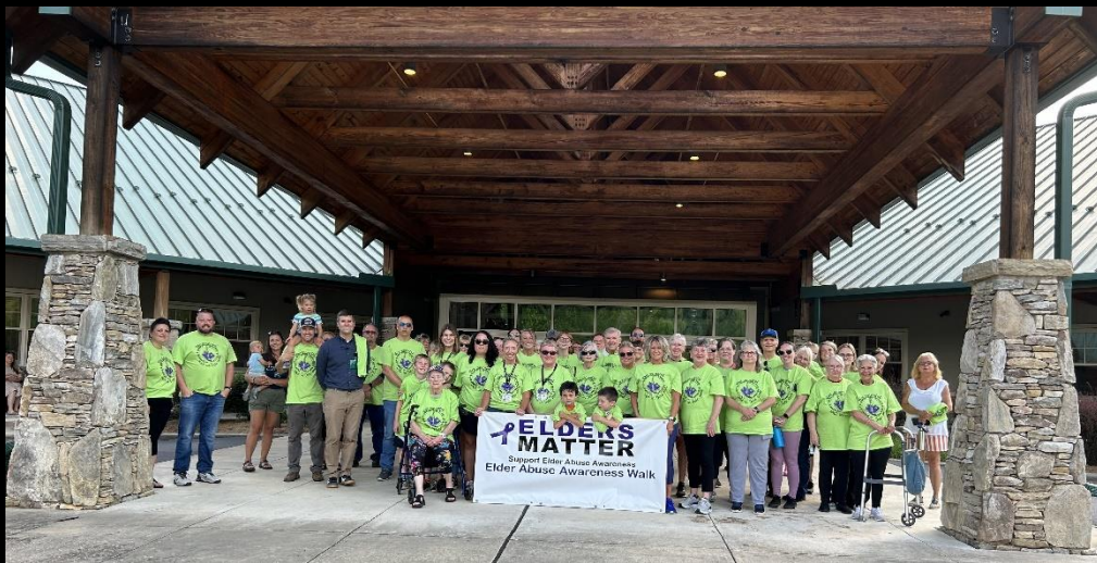
Elder Abuse Awareness Walk