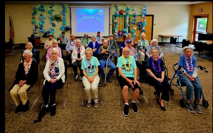
90's Birthday Party