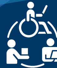
Intellectual/ Developmental Disabilities (I/DD)