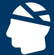
Traumatic Brain Injuries (TBI)