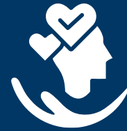
Serious Mental Illness (SMI)

If NC Members had Medicaid Direct services for these needs, NC Medicaid plan may be moved to a Tailored Plan. The name is changing, but the services are not.