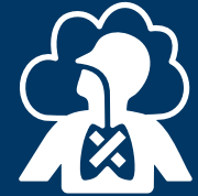
Severe Substance Use Disorders (SUD)